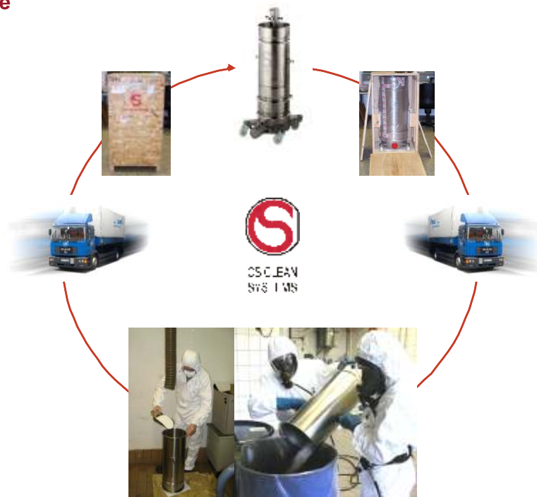
Refill cycle of spent absorber columns

Our team is committed to providing all customers with access to state-of-the-art technology and professional long-term, high-quality after-sales support. Regardless of our customers' requirements, our full support is guaranteed.