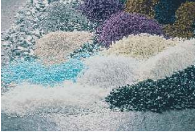
Application-specific granulates developed in CS CLEAN SYSTEMS' research laboratory

CS CLEAN SYSTEMS is the technology leader in dry bed chemisorption technology with over 25 years experience in semiconductor exhaust gas treatment.