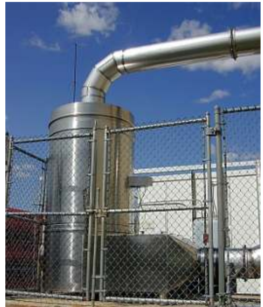
Passive CLEAN-PROTECT CP1000 model

Passive systems are installed with the gas cabinet extract air flowing continuously through the chemisorbent bed. This safety installation guards against uncontrolled escape of those gases from up to ten gas cabinets.