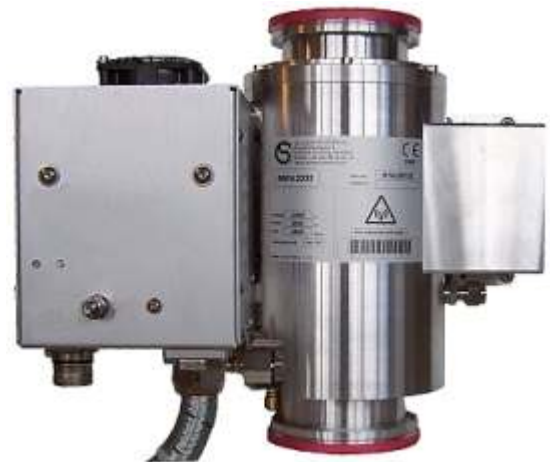
Microwave Applicator PCS PIRANHA

In contrast to downstream installations the PFCs are not diluted with N 2 pump ballast. The system is particularly eco-friendly due to its low energy consumption corresponding to a reduced CO 2 output. Moreover, no nitrogen oxide compounds are created.