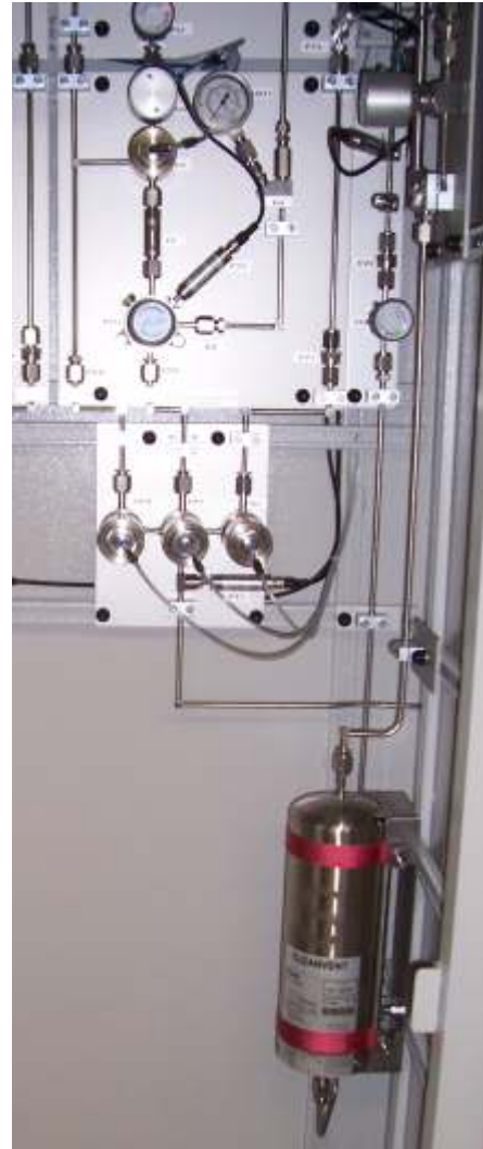
Installation of a CLEANVENT Cartridge

CLEANVENT cartridges can be employed on both low and high pressure applications.